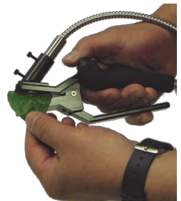
An optional leaf clip includes an internal reference standard.