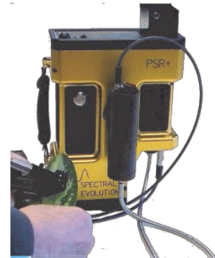
A field portable spectroradiometer provides valuable information for forest canopy research.

Plus a range of accessories including contact probe, pistol grip probe, benchtop reflectance probe with soil compactor, leaf clip, and more. The PSR+ includes a built-in LCD display with storage in the unit of up to 1000 spectra. The PSR+ can use direct attach or FOV lenses. The RS-3500 uses a fiber optic connection and FOV lenses. DARWin saves all spectra and associated metadata as ASCII files for use with other third party software including R and ENVI.