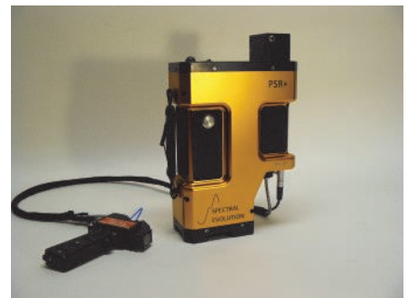
Use the PSR+ with our contact probe for soil analysis or our benchtop probe with soil compactor.

26 Parkridge Road ♦ Suite 104 Haverhill, MA 01835 USA Tel: 978 687-1833 ♦ Fax: 978 945-0372 Email: sales@spectralevolution.com www.spectralevolution.com