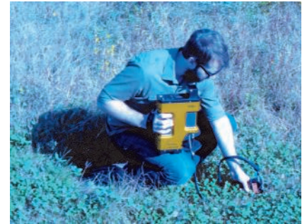
PSR+ is lightweight and easy to use—ideal for analysis in the field.

The PSR+ can be used with a tablet, laptop, or handheld microcomputer. An all solid state photodiode array design ensures that it won't break down in the field. Field swappable fiber means a break doesn't require sending the instrument back to the factory. The PSR+ weighs seven pounds and fits in an optional backpack. Two re-chargeable Li-ion batteries keep it powered for a full day of data collection.