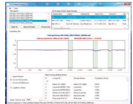
Illite spectra identified using three spectral match regions.

26 Parkridge Road ♦ Suite 104 Haverhill, MA 01835 USA Tel: 978 687-1833 ♦ Fax: 978 945-0372 Email: sales@spectralevolution.com www.spectralevolution.com