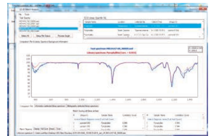
Pyrophyllite spectra identified with EZ-ID.