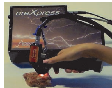
The oreXpress with the exclusive Miniprobe's 3mm spot size for field or core shack use.

The oreXpress, oreXplorer and oreXpert spectrometers cover the spectral range from 350-2500nm. The oreXpress offers high resolution/high sensitivity, the oreXplorer offers higher resolution while the oreXpert is the highest resolution field spectrometer available. They are designed for field use with a rugged and durable chassis, battery power for a full day of scanning and a backpack for portability. They can be equipped with contact probes to provide consistent illumination for scanning your samples. These spectrometers are available with EZ-ID mineral identification software and access to three mineral spectral libraries: the USGS library and the optional SpecMIN and GeoSPEC libraries for a total of 2600 spectra of over 1000 minerals. EZ-ID allows a geologist to perform un-mixing of minerals in a sample using match regions to focus on different absorption features for different minerals.