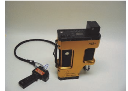
The PSR+ field spectroradiometer and leaf clip can be used to measure a range of properties in soil including soil moisture, TOC and clay content.

Spectral Evolution also offers an optional GETAC PDA with a digital camera and GPS to tag photos, coordinates, voice notes and altimeter readings to your scans.