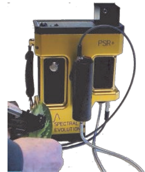
The PSR+ with our unique leaf clip can take field measurements to determine plant health.

The PSR+ is a high resolution, field portable spectroradiometer ideally suited for vegetation, canopy and crop studies. With its solid state design and three photodiode arrays, it provides a rugged and reliable way to measure plants in situ. Auto-shutter, auto-exposure and auto-dark correction deliver fast one-touch operation. Spectral Evolution field spectroradiometers are available with accessories that include our handheld contact probe, benchtop probe, and unique leaf clip with integrated light source to keep heat away from your samples.