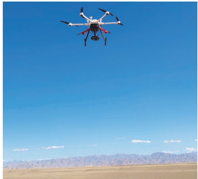
RS-8800 mounted on a UAV.