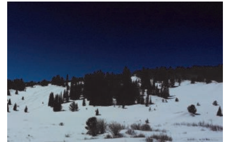
Clear blue sky and a late season snowstorm on Caribou Road in Nederland, Colorado where sample snow and ice scans were collected.

For more information contact Spectral Evolution today!