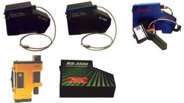
PSR+ , SR-6500, RS-5400, RS-8800 and RS-3500 are designed for field use including in situ measurements of snow and ice.