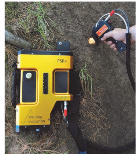
A soil measurement being taken with a SPECTRAL EVOLUTION PSR+ field spectroradiometer.

26 Parkridge Road ♦ Suite 104 Haverhill, MA 01835 USA Tel: 978 687-1833 ♦ Fax: 978 945-0372 Email: sales@spectralevolution.com www.spectralevolution.com